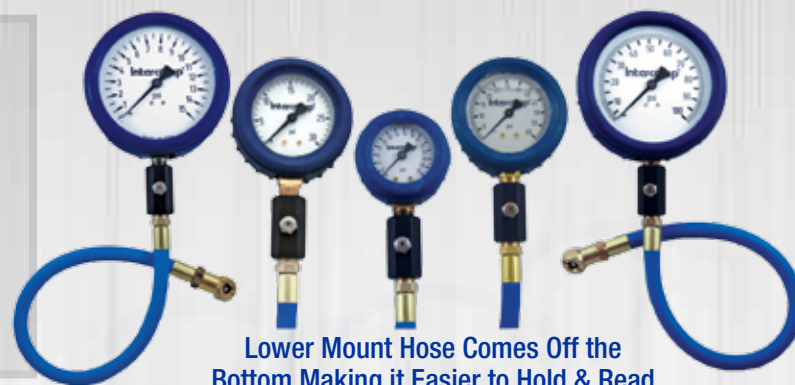
Lower Mount Hose Comes Off the Bottom Making it Easier to Hold & Read