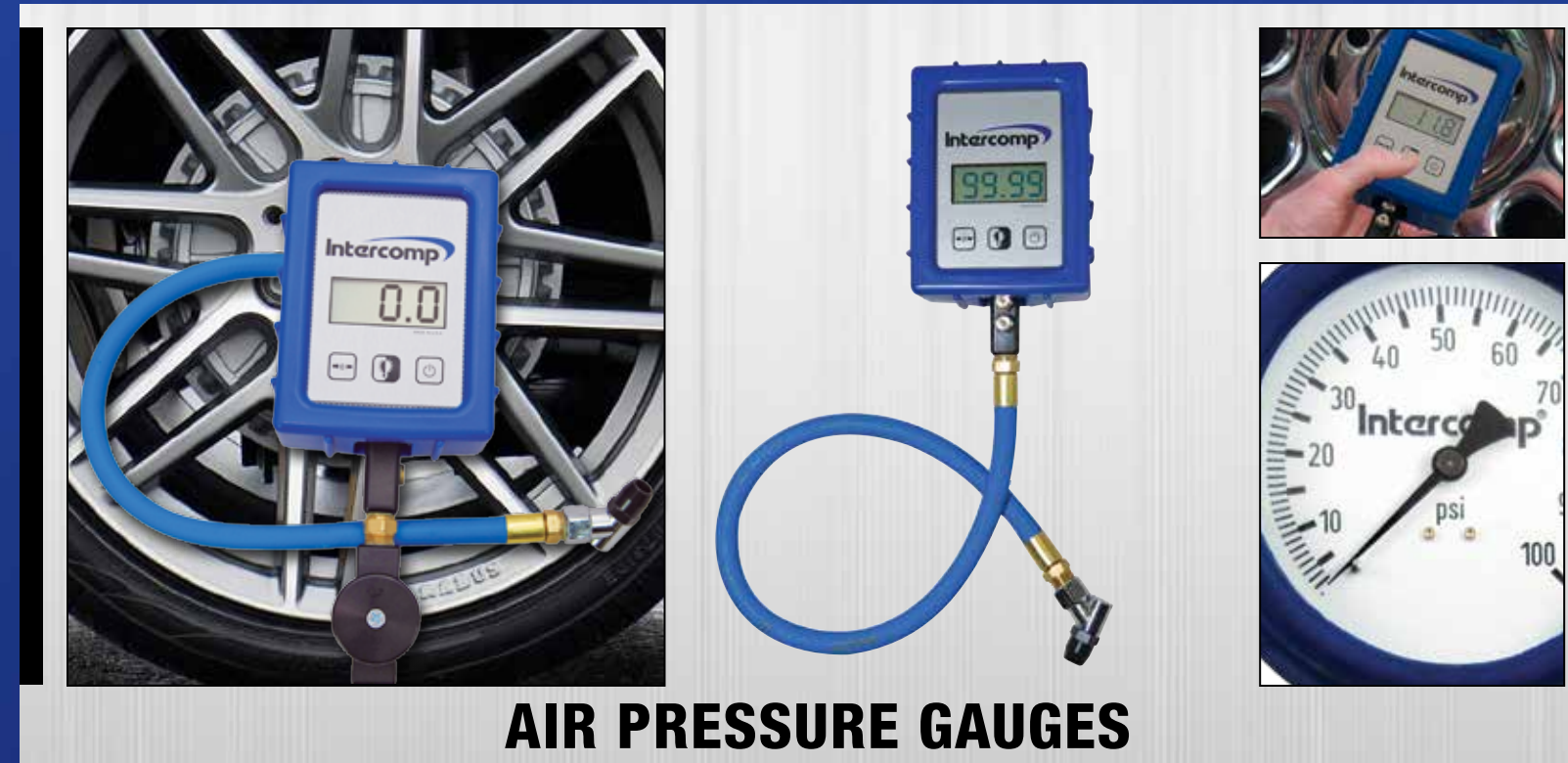
AIR PRESSURE GAUGES

Intercomp® advanced weighing technology . . . by any measure